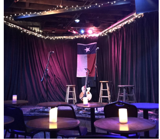
The iconic Anderson Fair stage ready for the show to begin.