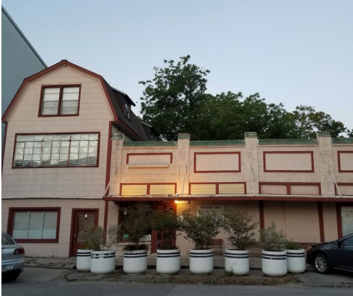
Anderson Fair is on Grant Street behind Texas Art Supply