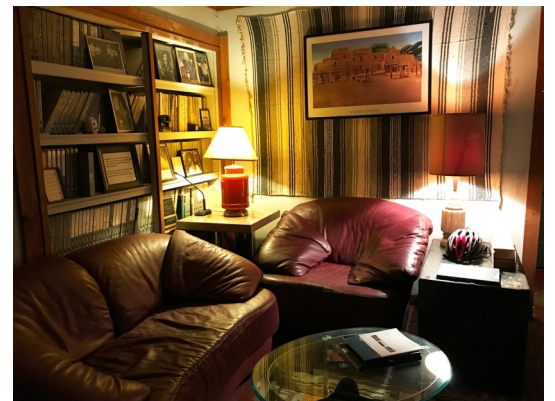
A lovely side room to lounge and visit.