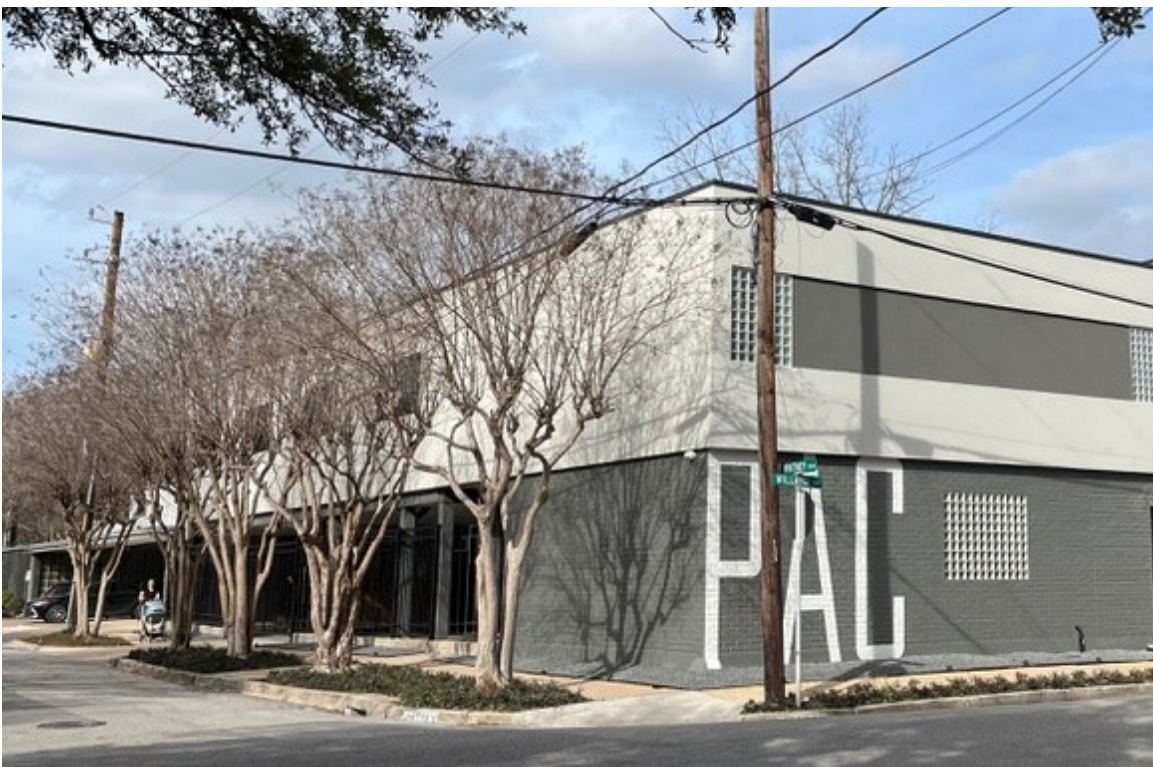
PAC Art Exhibit and Residency Space