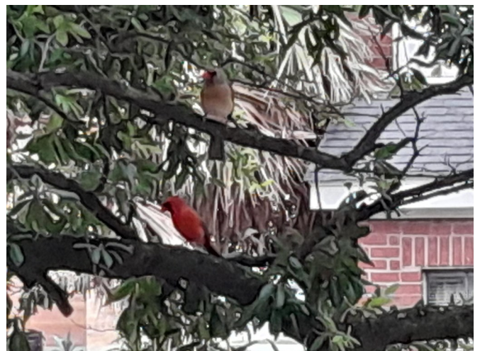
Photographed here are some of the cardinals seen on Stanford St.