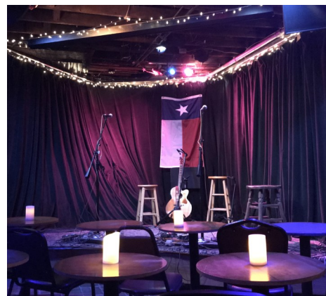
The iconic Anderson Fair stage ready for the show to begin.