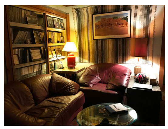
A lovely side room to lounge and visit.